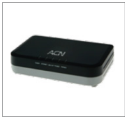
ACN Phone Adapter